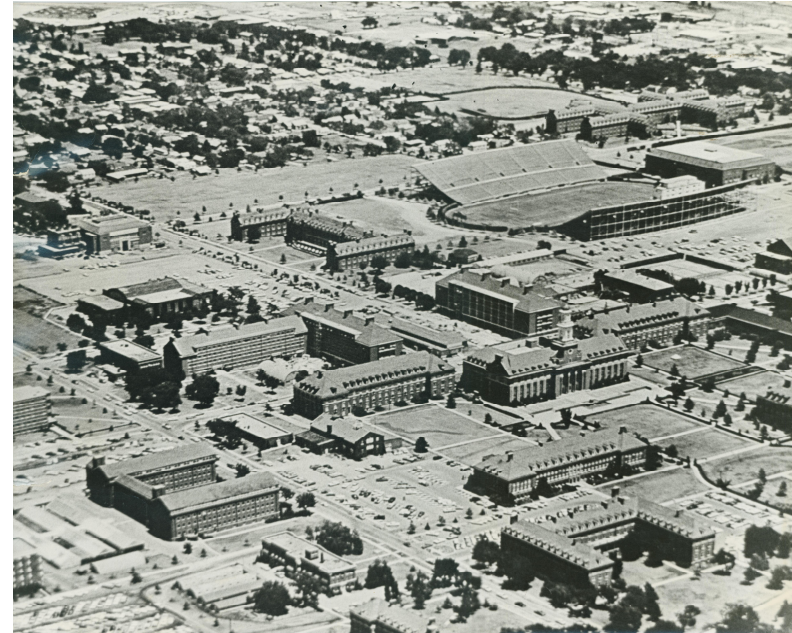
Campus in early 1960's