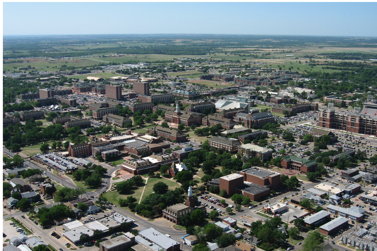
Campus in 2006