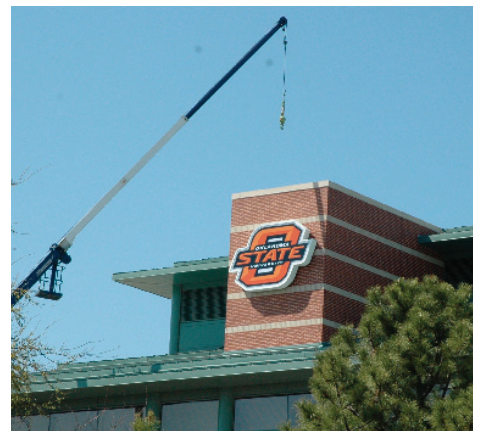
An OSU logo was added to the outside of OSU-Tulsa's Helmerich Research Center. Drivers on I-244 can easily see the sign that helps identify the campus and displays OSU-Tulsa's orange pride.