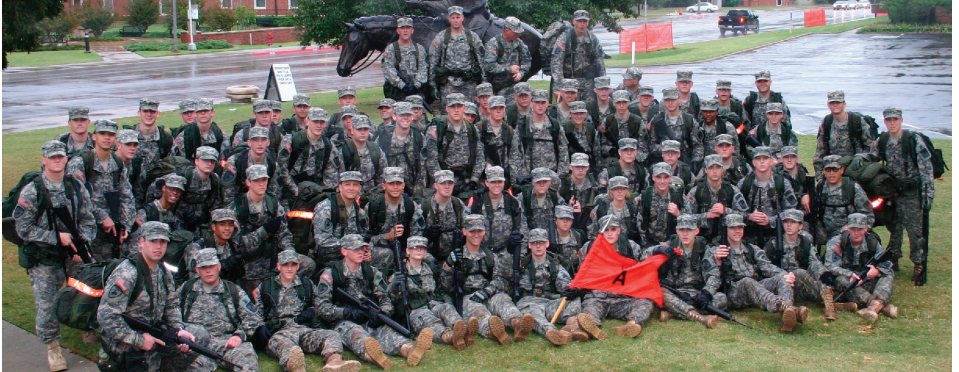
In October, OSU Army ROTC conducted its fall field training exercise. More than 80 cadets participated in rappelling, basic rifle marksmanship, land navigation, and high ropes, leadership and team building training. The exercises prepare OSU cadets for the leadership development and assessment course at Fort Lewis, Wash., where cadets from throughout the nation participate. OSU Army ROTC consistently produces cadets that rank in the top 10 percent of the nation at the course.