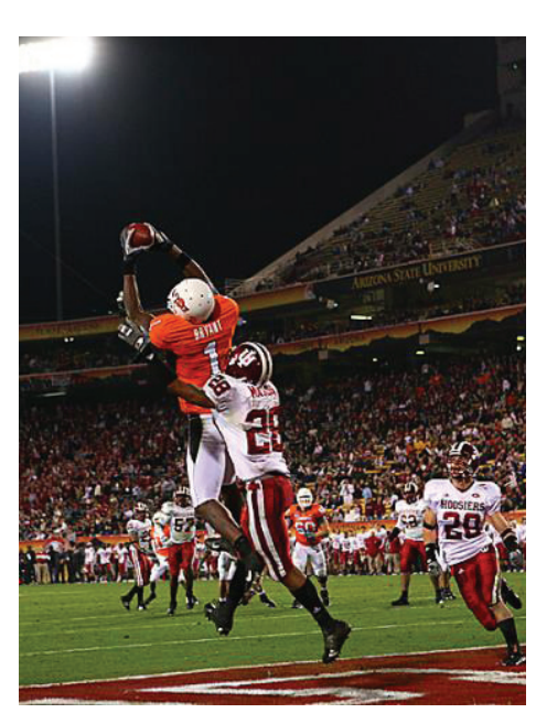
Sports photos by James Schammerhorn 8 Accomplishments/News