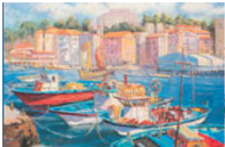
Fishing Fleet of Marina Grande

The clinic is available on a walk-in basis. Fees will be comparable to those charged at the health clinic at OSU-Stillwater and insurance will be accepted.