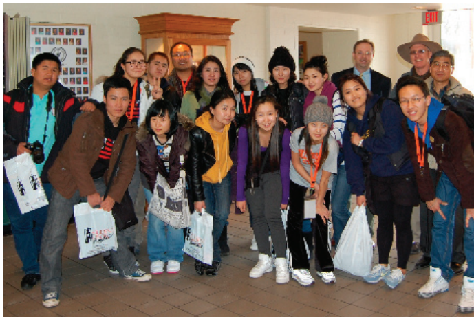
Students and a faculty member from the Mongolia International University and host OSU faculty pause for a photo in McElroy Hall lobby at the OSU Center for Veterinary Health Sciences during a tour of the veterinary center. The Mongolian Annual Vision Trip is designed to identify partnerships with other institutions.