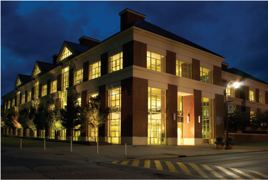
Robert M. Kerr Food & Agricultural Products Center