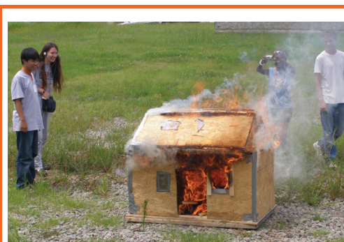
Fired-Up About Research, Science and Engineering