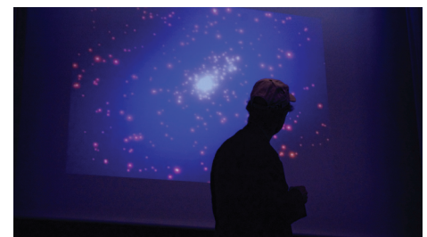
Theoretical physicist Dr. Frank Wilczek showed our universe is a strange place.

Gardiner Art Gallery presented "Navigating the Mind: Psychological Themes in Work," the University Wind Ensemble, Concert Band and Symphonic Band performed and Julius Caesar took the stage at the OSU Theatre.