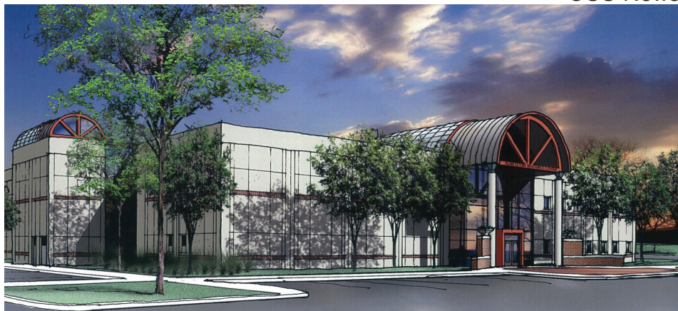
Artist rendition of the Agriculture Resource Center,