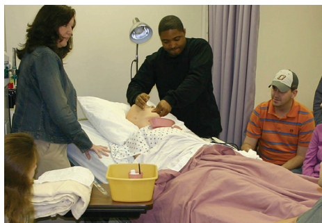
Both the Oklahoma Board of Nursing and the National League of Nursing Accrediting Commission commended the OSU-Okmulgee's revised program

Funding for the projects will come from the $40 million appropriation approved in 2006 by the state legislature. The improvement projects for residency programs will directly and positively impact the number and quality of physicians serving Oklahoma patients, officials said.