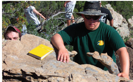
An OSU geology student got hands-on field experience at the geology field camp in Colorado.