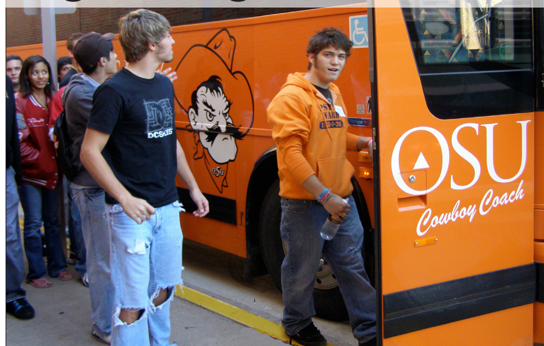
More than 120 high school students from across the state climb aboard Big Orange Buses Tuesday to return to their hometowns following a day on the OSU campus. This week's bus trips to Ardmore, McAlester and Lawton are part of a month-long Oklahoma tour hosted by the OSU Office of Undergraduate Admissions. Earlier stops included Tulsa and Oklahoma City. Additional bus trips will be offered in Bartlesville and Muskogee Nov. 13 and Alva, Ponca City, Woodward and Enid Nov. 20.