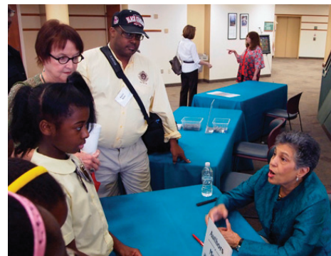
Author Carlotta Walls LaNier spoke with students during a book signing at the Celebration of Books at OSU-Tulsa. LaNier is the author of "A Mighty Long Way," which tells of her experiences as one of the Little Rock Nine.