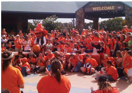
More than 300 OSU alumni and friends celebrated Pistol Pete's 87th birthday party at the Oklahoma City Zoo on Oct. 10. The party is an annual event sponsored by the Central Oklahoma OSU Alumni Chapter.

This year's campaign featured several activities intended to raise awareness and encourage donations from students, faculty and staff. The Tulsa campuses also participated in the annual United Way Day of Caring on Sept. 10.