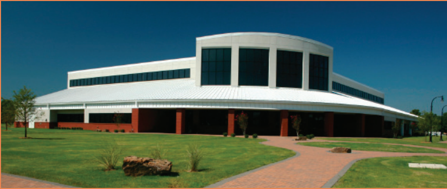
OSUIT dedicated its new Allied Health Sciences Center Sept. 24. OSUIT built the state-of-the-art, 25,000-square-foot building to accommodate an increased number of nursing students in the program. Next January, OSUIT will start another group of 30 students in the nursing program, after having started a new group of students in August.