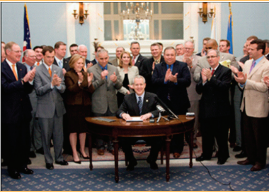
Oklahoma Gov. Brad Henry signed into law March 9 a bill that created a public-private agreement and funding for the OSU Medical Center.