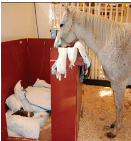
The Equine Critical Care Unit will benefit patients like this premature foal and mother, who are now isolated rather than being in the main equine barn with other horses.

The unit will be located adjacent to the east of the hospital, with about 4,600 square feet of new and renovated space for the critical care needs of equine patients. It will be a fully enclosed, climate controlled facility with video monitoring systems, including the latest in critical and intensive care equipment.