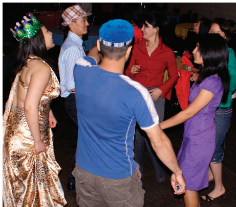
Carnival 2009 at Wes Watkins Exhibit Hall celebrated a widely recognized international festival while promoting study abroad and the many cultures represented at OSU.