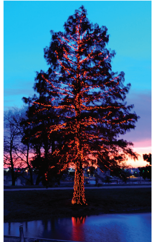
OSU-OKC's tree is a 50-foot bald cypress that has been decorated with hundreds of strands of orange lights.

OSU-OKC highlighted the season with a new event, its holiday tree-lighting ceremony complete with orange lights. The tree is located by the pond at the Administration Building, and the public was invited to enjoy cookies, hot chocolate, singing by pre-K students from the campus Child Development Center, and a visit from Santa Claus.