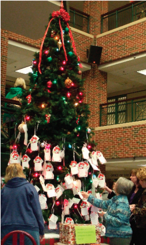
People gather around the Angel Tree in Stillwater's Student Union Atrium to select an "angel" to help for the holidays.

Students, faculty and staff are showing their holiday spirit on the campuses of Oklahoma State University.