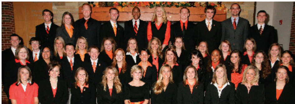
2008-2009 Seniors of Significance