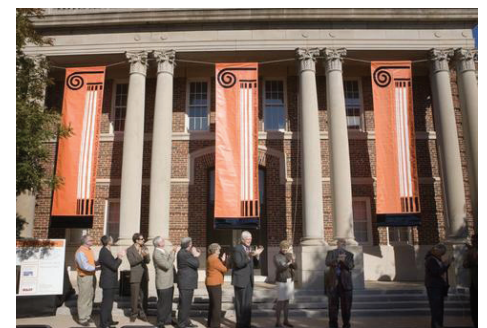
The Donald W. Reynolds School of Architecture Building renovation and expansion has officially begun.

The project is expected to be completed by summer 2009.