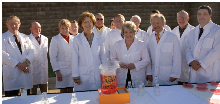
Dignitaries donned white veterinary coats and poured various liquids into a large beaker to create an “OSU orange” solution in the OADDL groundbreaking ceremony.