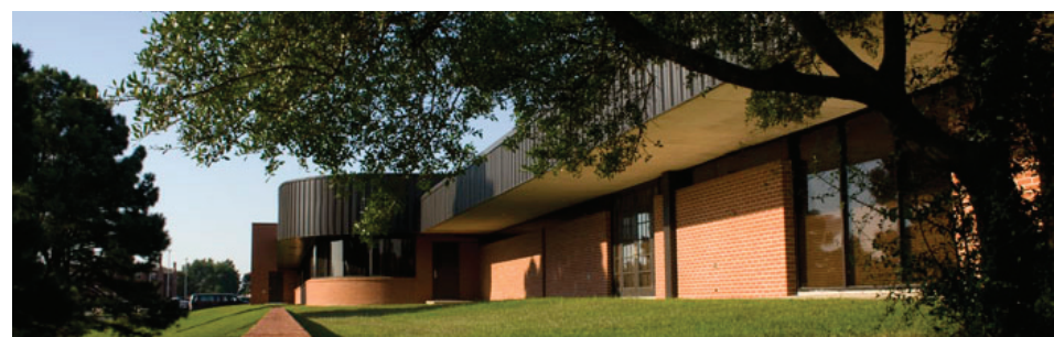
Grady W. Clack Student Success Center

The expanded facility will make it possible for the OADDL to remain a member of the National Animal Health Laboratory Network system, which allows it to handle certain laboratory tests for Oklahomans that would otherwise be sent out of state.