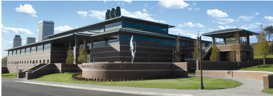
OSU-Tulsa's Helmerich Advanced Technology Research Center