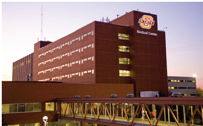
The OSU Medical Center in Tulsa now sports a new sign visible from afar.

The hospital continues to provide quality health care to patients as it trains Oklahoma physicians. The OSU Medical Center is the largest osteopathic teaching center in the country, training 126 residents each year in primary care and sub-specialty areas. The hospital and the OSU medical school have trained more than 2,000 physicians, many of them practicing in rural Oklahoma.