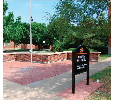
The Center for Veterinary Health Sciences flag pole in front of McElroy Hall has a new home. The Military Veterinarian Honor Court was constructed to honor OSU veterinarians who have served or are currently serving in the military. It is located next to the new Walk of Honor and bricks can be purchased for $50 to honor a special military veterinarian. The court's formal dedication is set for the fall.