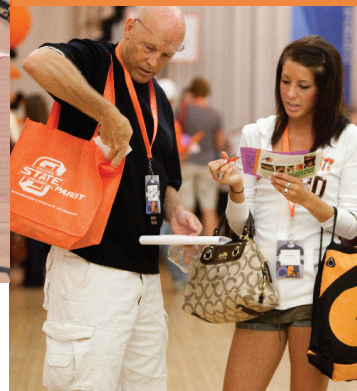
2009 New Student Orientation and Enrollment