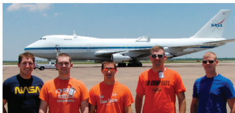
OSU's "Space Cowboys"

"Hopefully, the results of the experiment will provide valuable data for the students and the scientists at NASA on how large space habitats can be deployed under