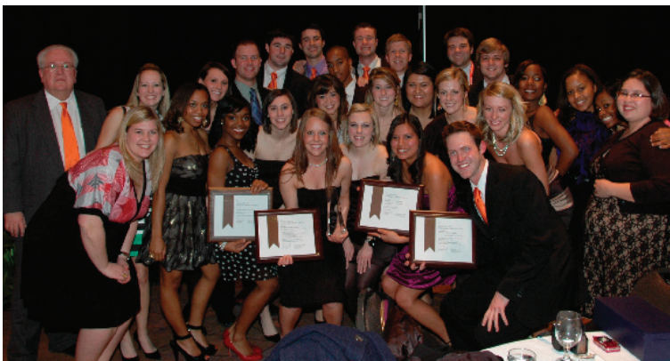
The OSU Greek Community was recognized for its excellent programs at the leadership conference.

As a first-time awards applicant, the Multicultural Greek Council was recognized in both categories in which it applied in the Multicultural/Unified Greek Council Division: academic achievement and philanthropy and community service.