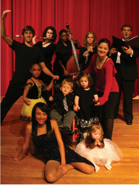
The Oklahoma Music Therapists Association, OSU Department of Music, the Mya Gonzales Foundation and OSU Greek Life will present "Performers on the Rise" at 2:30 p.m. on April 11 in the Seretean Center for Performing Arts on the OSU campus. Proceeds from the benefit concert will go to the Mya Gonzales Foundation, which provides support for the Rise School and which is part of the Department of Human Development and Family Science.