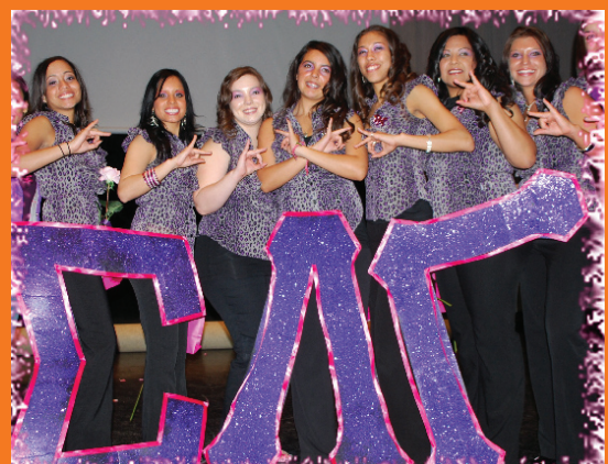
Sigma Lambda Gamma's seven new initiates celebrate the establishment of their sorority at OSU.