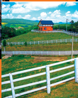
Kuzumaki Dairy Farm