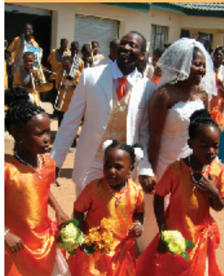
The Kalaba wedding party

Kalaba is now a senior economist in Trade and Industrial Policies Strategies in Pretoria, South Africa.