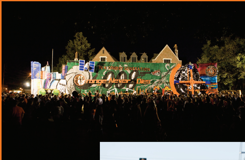
The traditional Walkaround was best viewed after dark.

Who else to serve as the 2008 Grand Marshal for the Sea of Orange Parade but Pistol Pete himself. This was the 50th anniversary of Pistol Pete being the OSU mascot.