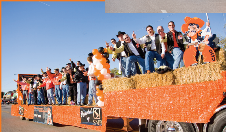
That's a LOT of Cowboys. It took a big trailer to hold former Pistol Petes.