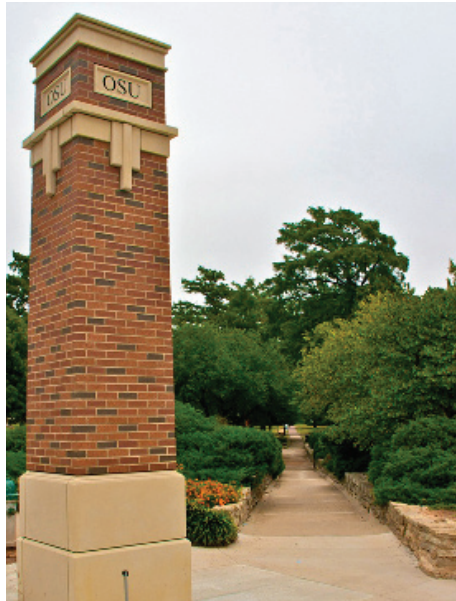
OSU's formal campus entry on the corner of Monroe and University Streets now has identical twin pillars designed in the OSU Georgian style.

Despite years of steadily improving highway safety and roadway fatalities at historic lows, motorcycle riders remain one of the highest-risk groups on America's roads.