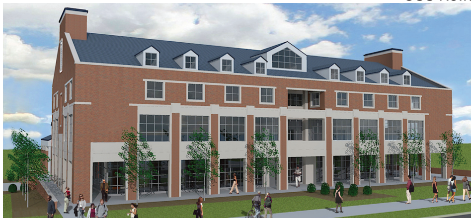
North Classroom Building

New facilities and improvements to current buildings are part of the $826 million campus master plan that will transform OSU over the next five to seven years, making it more competitive in academics, campus life and athletics.