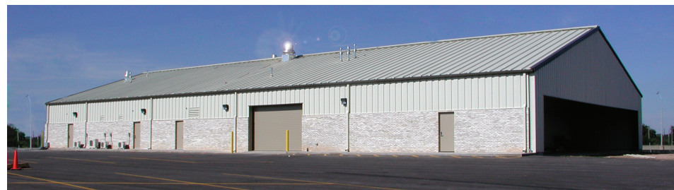
OSU-OKC Physical Plant Building