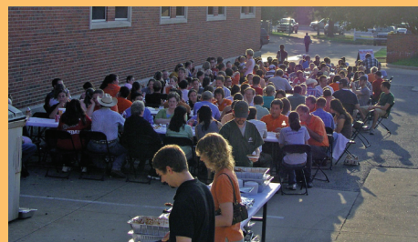
Approximately 375 students, faculty, staff and families enjoyed great weather and great food at the CVHS All School Picnic, co-sponsored by the College of Veterinary Medicine and Nestlé Purina.

The American Institute of Chemical Engineers student chapter at OSU has received the Outstanding Chapter Award for the ninth consecutive year to recognize the top 10 percent of all student chapters in the country.