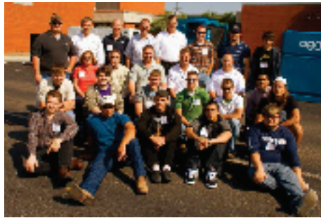
Aggreko employees and students from Louisiana, Texas and Missouri.

The company will recruit and place students in the two-year, six-semester program, half of the time on the Okmulgee campus and the other half on paid internships at Aggreko service centers.